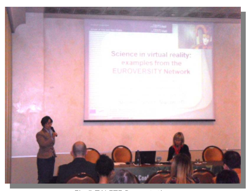
Fig.5 TALETE Presentation

The paper was published in the following publication: