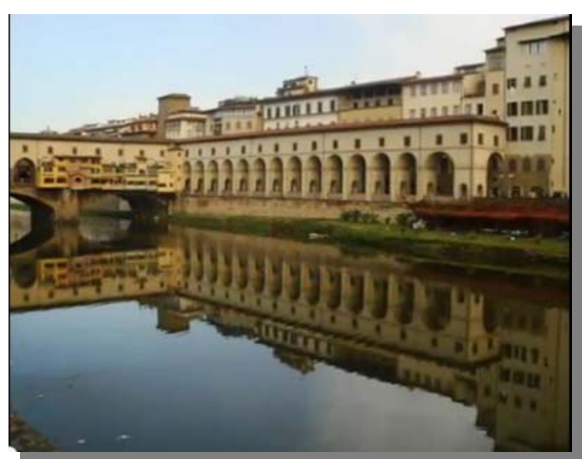
Fig.2 Florence City

The International Conference New Perspectives in Science Education took place in Florence, Italy, on 8 -9 March 2012.